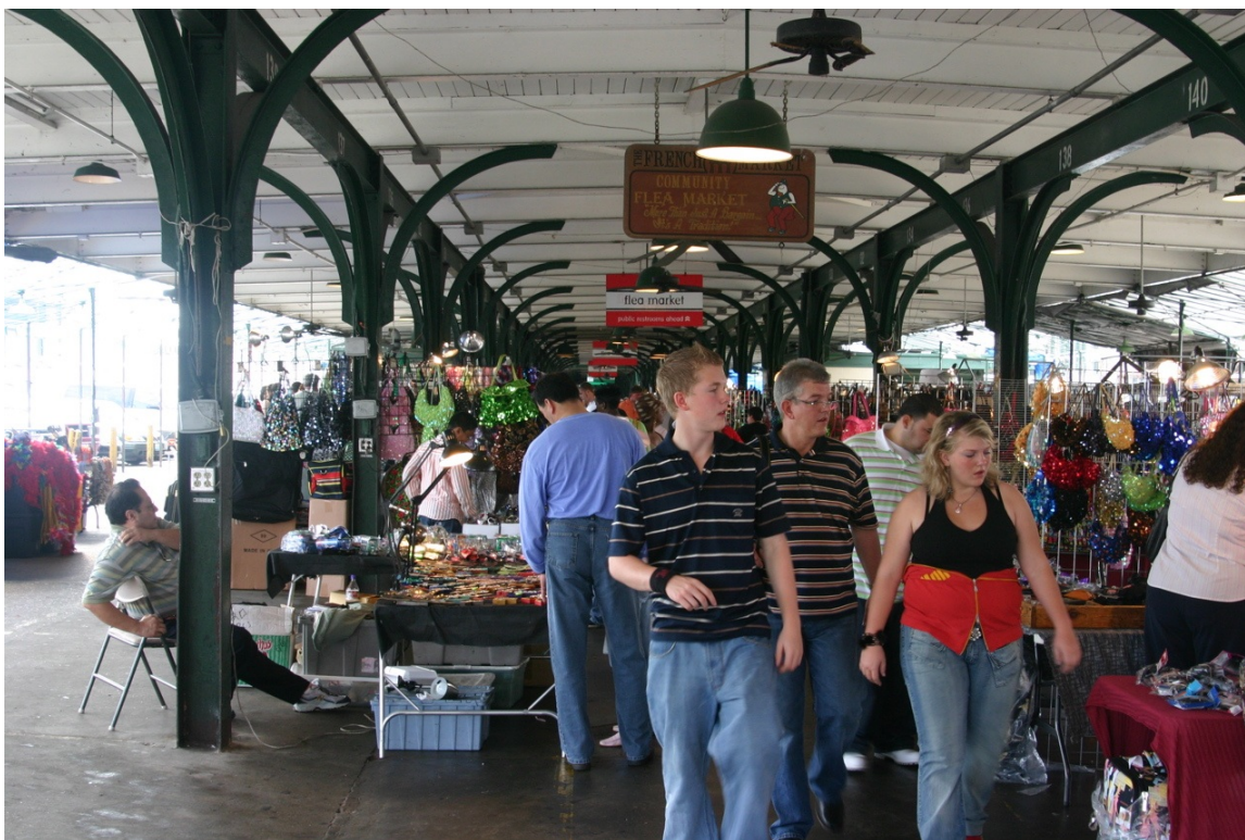
Shoppers in the French Quarter flea market. Click picture to enlarge.

We end this little three-part photo-essay on where New Orleans is up to with the brightest spot: the French Quarter. I took these shots on New Year's Day.