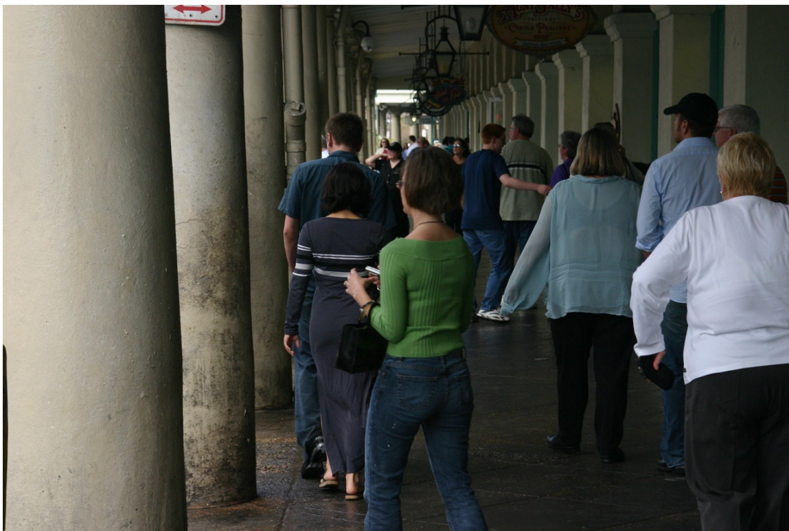
Tourists in the French Quarter. Click picture to enlarge.

We heard many foreign accents amongst the tourists wandering around.