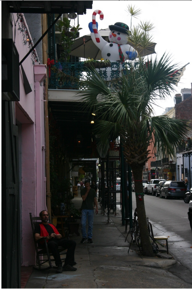
Snow men and palm trees in the French Quarter. Click picture to enlarge.

Of course, it's not good to look too close: