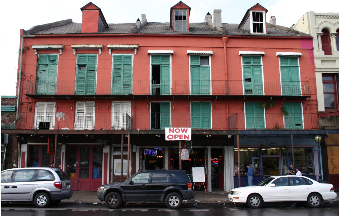
Hurricane damage in French Quarter. Click picture to enlarge.

And this is always on the back of our minds: