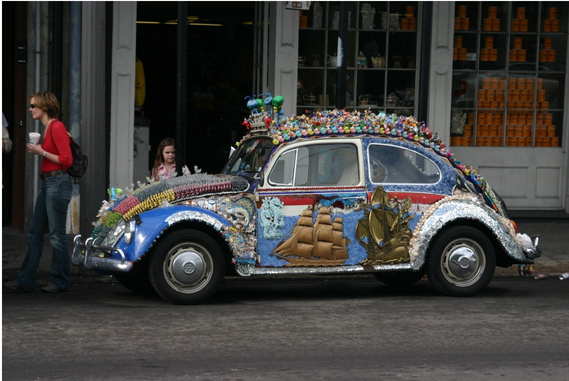
VW bug in French Quarter. Click picture to enlarge.