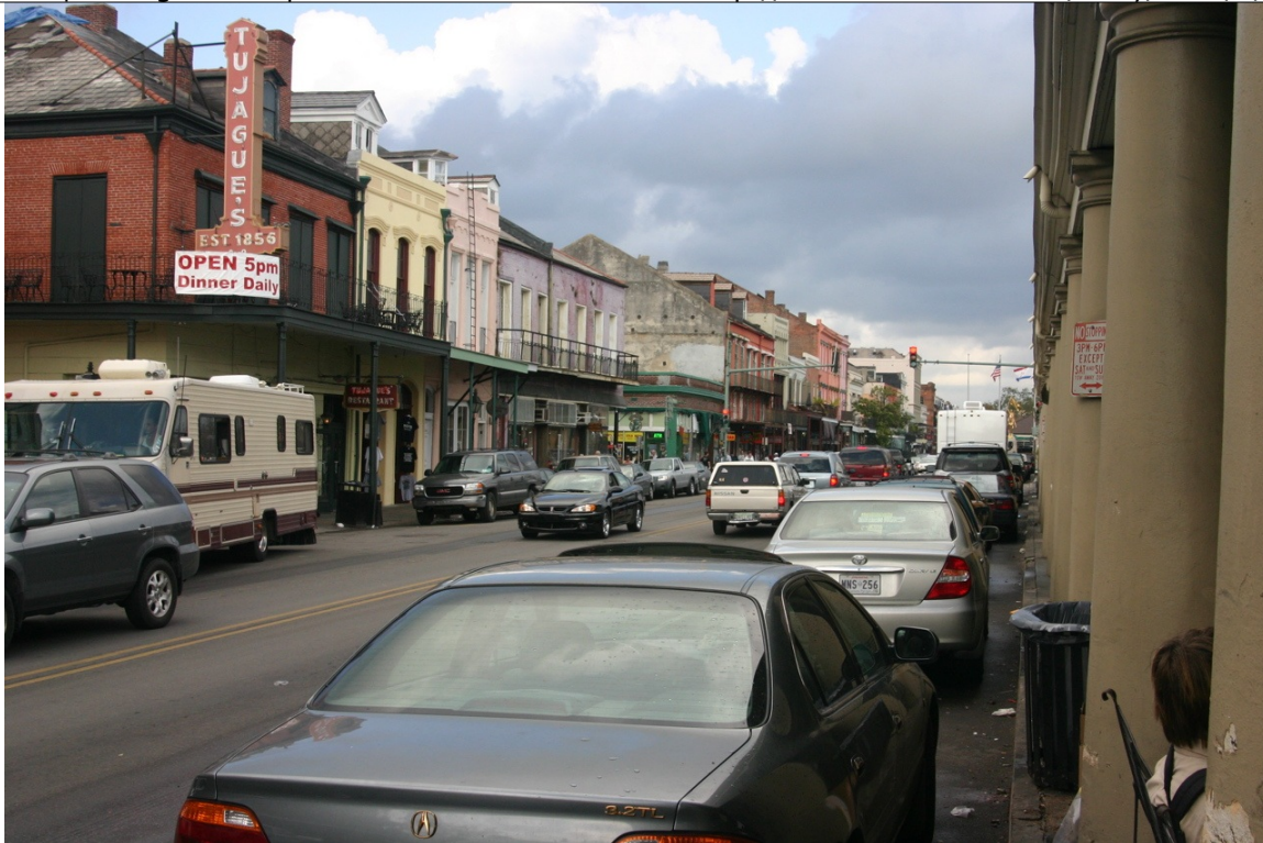
New Year's Day tourist traffic in the French Quarter. Click picture to enlarge.

We heard many foreign accents amongst the tourists wandering around.