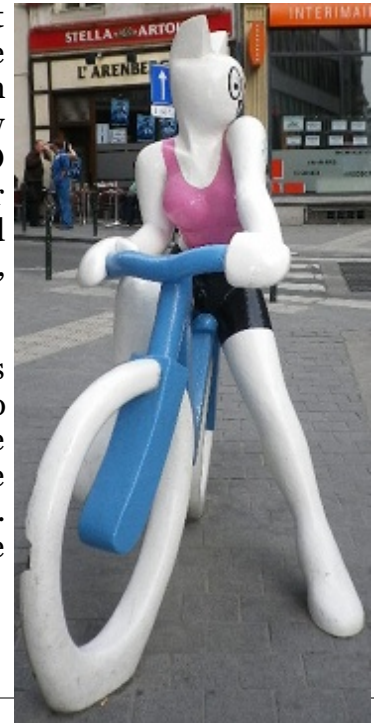
A monument to the Cycling culture in Brussels.

On a sunny day in April we left the hotel early in the morning on a pleasant walk to the venue. Brussels is a pleasant city, very walkable, and though Belgians are famous for not being the best drivers in Europe, the traffic is slow and quiet. Bikes everywhere, in every direction, for they have the priority in the city and most traffic signs do not apply to them (why can't it be like that where I live?) They tell me that in Flanders the bicycle cult is even deeper; it reminds me that I don't know yet who won the Liège-Bastogne-Liège. The conference attendees gathered at an interesting 1920's style building to begin registration and by 9 o'clock they packed the large hall for the first session.