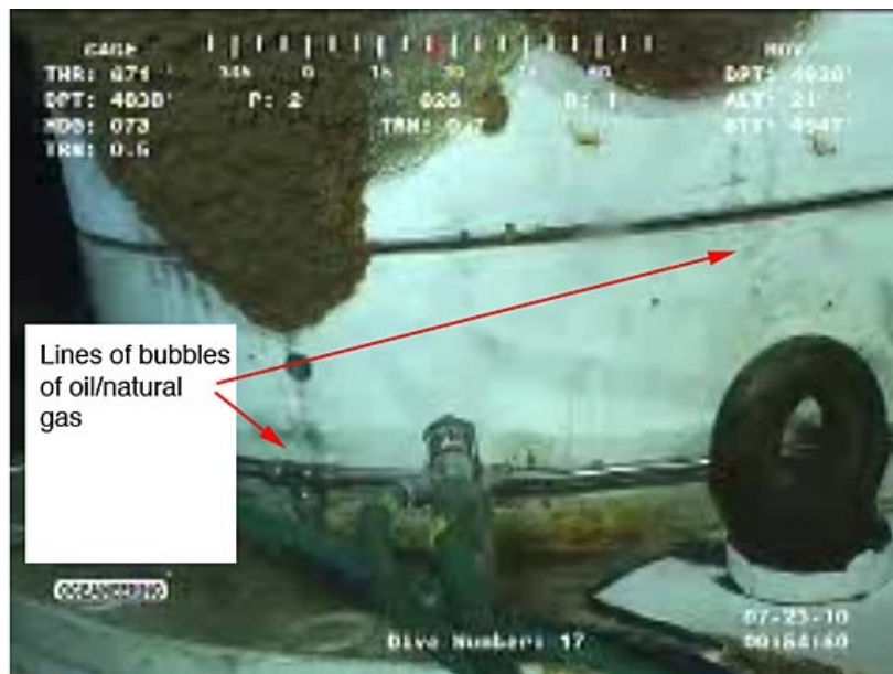
Leaks on the fittings around the wellhead