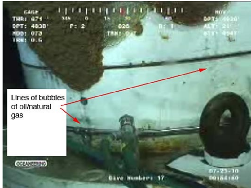
Leaks on the fittings around the wellhead