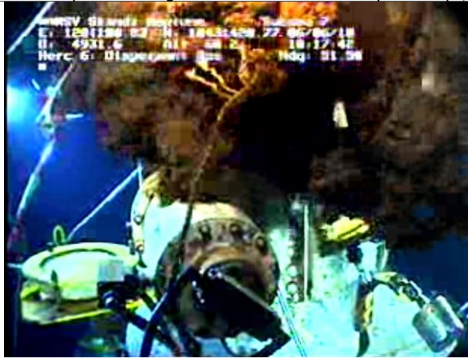
Flow at 10 am Sunday

And this was the picture that I posted from the same ROV at the time that the cap was installed