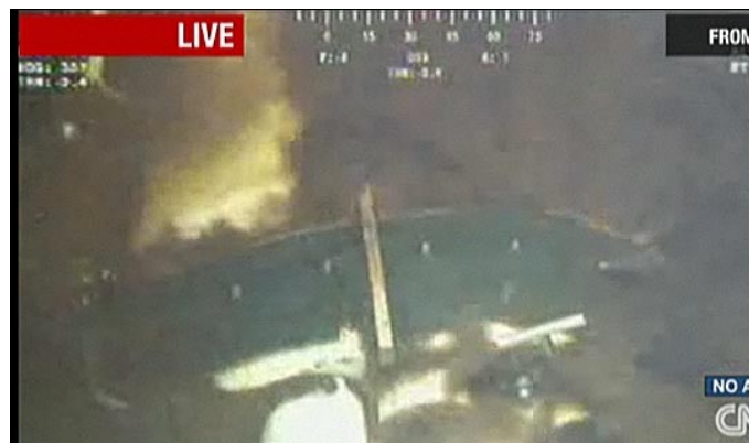
Leakage around the seal between LMRP 7 (yellow), the seal (greenish black) and the LRA. (white)

The question now arises as to whether the LMRP could be lowered sufficiently that it could seal to the flange surface, since it was no longer possible to get the seal needed on the upper surface of the riser, given that it had been distorted by the Shear which had cut the bent riser away.