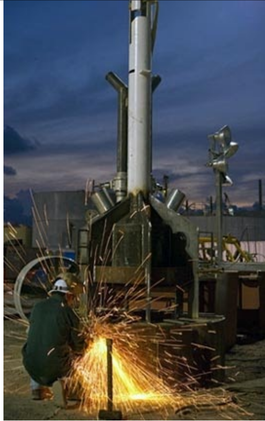
Building LMRP 7 on June 2nd at Port Fourchon ( BP )

The Lower Marine Riser Package (LMRP) was first connected to the riser, and to a methanol feed that would help, between them, to inhibit the formation of methane hydrides when the gas came into contact with the surrounding cold seawater. It was then slowly lowered to the site, and across into the fountain of oil and gas, and down over the top of the riser.