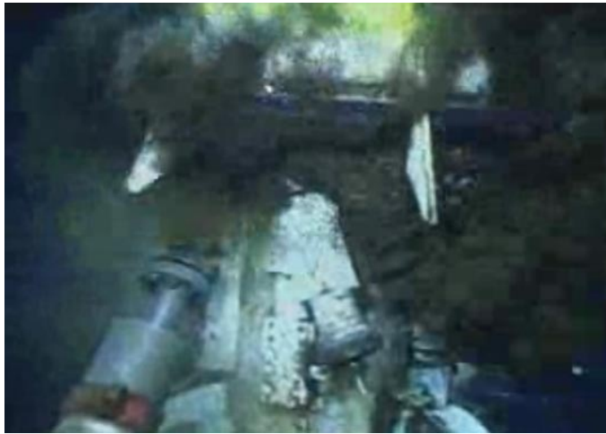
Leaks under the LMRP at 10:30 pm

For those who may not remember, this was the initial plan as it was proposed.