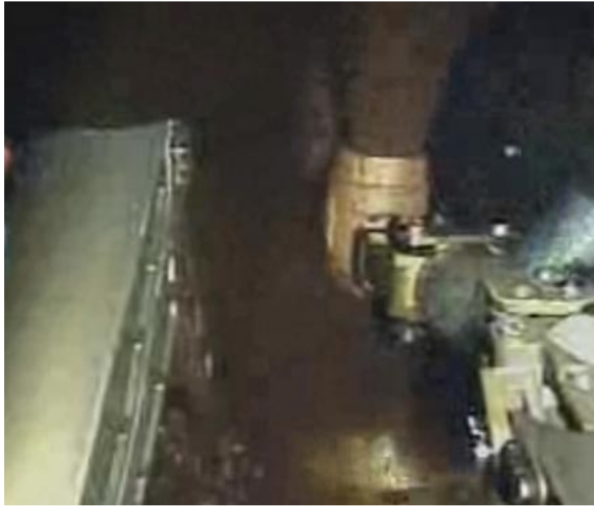
Flow through a relief port on side off the LMRP to relieve the pressure within it.

The Oil Drum | BP's Deepwater Oil Spill - Capping the Riser - Part 1 (Cap on, but leaks) with the Odebrecht code/6560 the flange, but the amount of oil that was leaking out of the bottom of the LMRP was still a considerable amount, even though some of the flow was also being bypassed through ports on the LMRP that could later be closed.