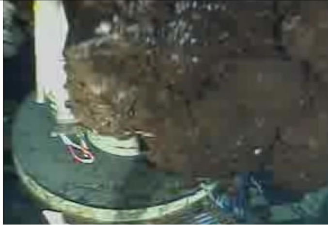
Oil and gas coming out from under the LMRP