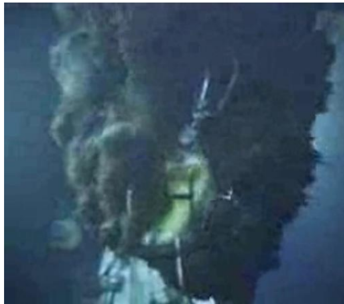
Lowering the LMRP into the cloud of oil from the riser.

The Lower Marine Riser Package (LMRP) was first connected to the riser, and to a methanol feed that would help, between them, to inhibit the formation of methane hydrides when the gas came into contact with the surrounding cold seawater. It was then slowly lowered to the site, and across into the fountain of oil and gas, and down over the top of the riser.