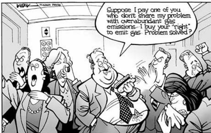
STUCK ON AN ELEVATOR WITH THE U.S. AT THE U.N. GLOBAL WARMING CONFERENCE

With Ross Garnaut's long awaited Climate Change Report due next week, the value of 'emissions trading' in the broader context of Australian Government environment policy deserves examination. While such a big ticket approach appears attractive on the surface, it may not be the golden bullet we are looking for and it may indeed distract attention from more immediate opportunities for government intervention. The premise of emissions trading or carbon trading, that the big end of town can clean up its act with the right mechanism may be overly optimistic. So while the Australian suggests emissions trading is the 'main mechanism to cut greenhouse gases and tackle climate change' others may suggest that practical regulation and guidance is more realistic in offsetting the costs (externalities) of the global economy which has become far too reliant on carbon heavy fossil fuels.