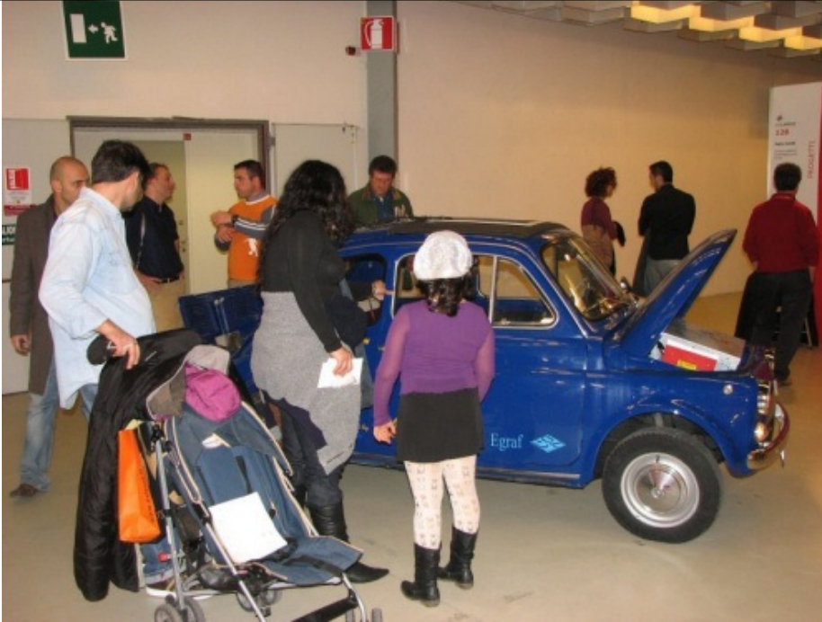
Fig 5. The electric 500 at the creativity fair in Firenze in October 2007. Pietro Cambi is the one at the back, discussing with the guy with the orange sweater.