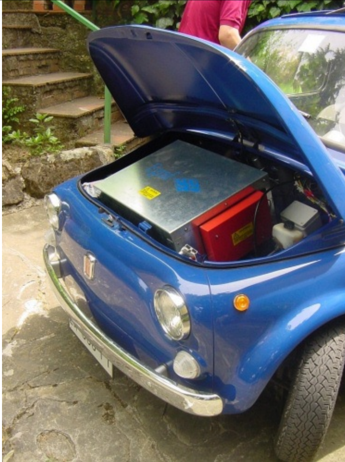
Fig 4. The battery pack. These lithium polymer batteries contain as much energy as about one liter of gasoline. Nevertheless, the engine is so efficient that the car can run for 100 km, if driven gently.

Recharging the batteries of the 500 at a domestic outlet takes a few hours for a full recharge but, in normal use, you don't completely discharge the batteries, so that about one hour and a half is sufficient. At the present prices of electricity in Italy, a complete recharge costs about Eur 1.2. Since we have a range of about 100 km, it follows that the cost per km of running the car is about 1/5 of what was the cost using gasoline. We also have charged it using the energy produced by the PV panels on the roof of Ugo Bardi's home. In that case the cost of the recharge is strictly zero.