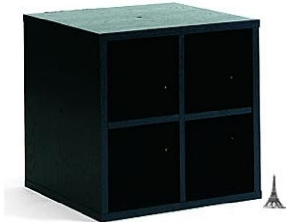
1 Cubic Miles of Oil (CMO) or 26.22 Gb or 71.82 mbpd

Last year, the world produced around 26.86 Gb of crude oil + condensate or 1.02 CMO. The figure below gives you an idea of the scale of a CMO compared to the Eiffel tower: