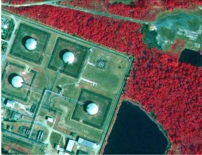
Figure 7: Hyperspectral Satellite Image of Oil Installation in Nigeria—Note dense jungle in close proximity to facility perimeter, a result of economics-driven design.

Finally, it is worth considering that energy infrastructure was designed to optimize economic performance, not security and defensibility. Economic considerations force an infrastructure design methodology consisting of largely centralized structures with multiple single points of failure, and networks vulnerable to cascading failures. As a result, even in oil producing states with functional security services, there is a high vulnerability to financially motivated infrastructure attacks. While a Nigerian scenario may seem unthinkable in the United States, consider our nation's success in interdicting the drug trade. The market for energy is significantly larger than the market for drugs—and so is the incentive to militants to conduct financially motivated attacks on energy infrastructure. If this analysis is correct, the increasing incentives to attack energy infrastructure will become yet another factor accelerating the rate of decline of global energy production.