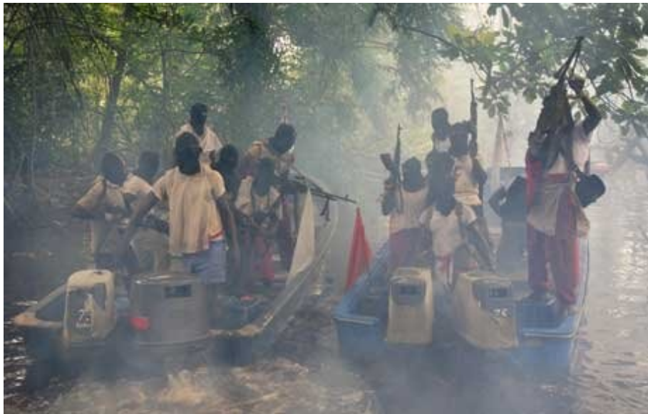
Figure 5: Heavily Armed Youth Gangs in Speedboats Rally in Permissive Terrain

Finally, because of the shift from a political motivation to a profit motivation, militants are no longer invested in preserving the long-term viability of Nigeria as an oil exporter. As a result, the targeting strategy has shifted from the temporary sabotage of infrastructure for political ends to threats of permanent destruction of key infrastructure nodes—targets that can force higher protection payments and therefore higher returns on investment. All three of these factors are contributing to the rapid tipping of the violence in Nigeria's delta from a stable, negative-feedback system to an escalating, positive-feedback system.