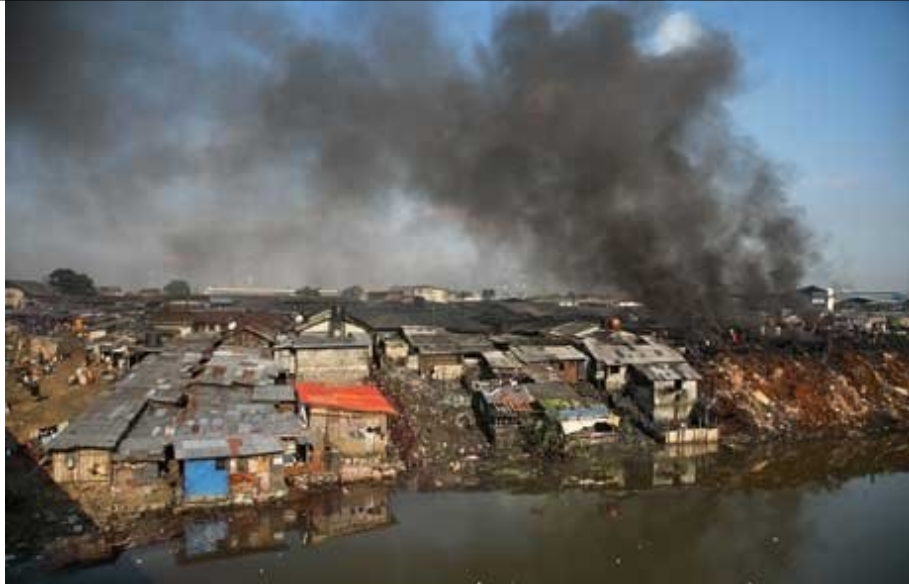
Figure 4: Grim Economic Reality Pushes Ijaw Youth to Crime

Finally, because of the shift from a political motivation to a profit motivation, militants are no longer invested in preserving the long-term viability of Nigeria as an oil exporter. As a result, the targeting strategy has shifted from the temporary sabotage of infrastructure for political ends to threats of permanent destruction of key infrastructure nodes—targets that can force higher protection payments and therefore higher returns on investment. All three of these factors are contributing to the rapid tipping of the violence in Nigeria's delta from a stable, negative-feedback system to an escalating, positive-feedback system.