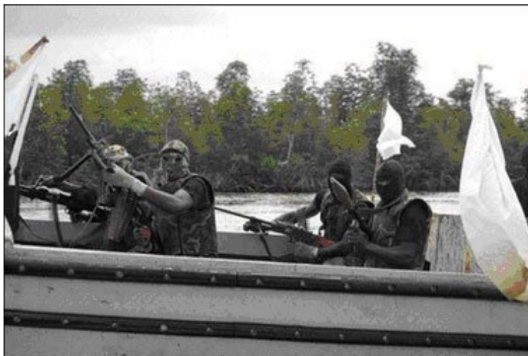
Figure 1: Nigerian Militants in a Speedboat

When a fire becomes sufficiently intense, its heat creates a rising column of air so strong that surrounding air is drawn into the void, creating a draft that sustains and intensifies the fire. It becomes a self-sustaining, self-intensifying organism: a firestorm. The violence in Nigeria's delta region has become a firestorm, and the consequences of this transformation will fundamentally impact that nation's ability to export oil. Recent events in the delta region have transitioned the violence there from a negative-feedback loop where there was a disincentive to militants to shut in too high a portion of Nigeria's oil exports to a positive-feedback loop where militants will compete to completely destroy Nigeria's capacity to export oil.