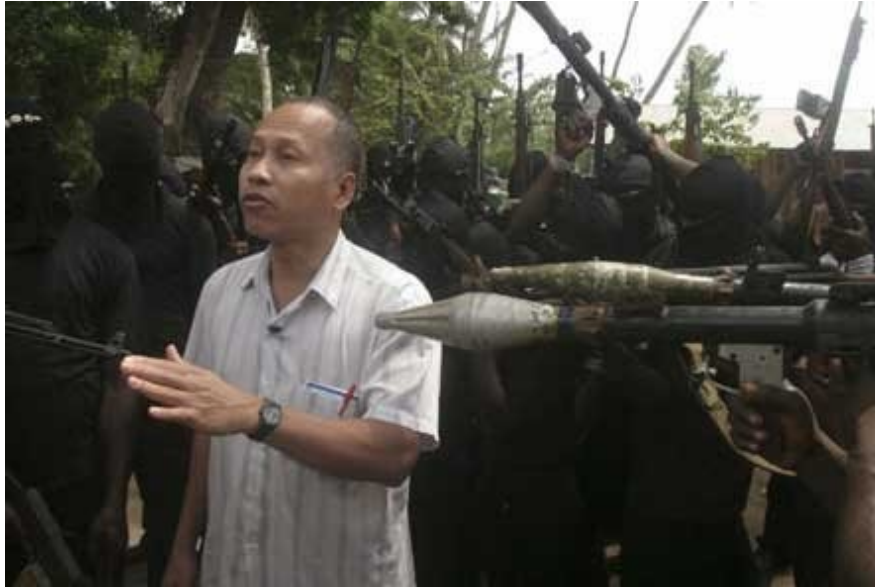
Figure 6: A Hostage Surrounded by Ijaw Militants

multiple actors, each competing to extort money from a limited target list of oil installations, foreign workers, and foreign oil companies. Because the actors are now militant youths seeking short-term financial gain, rather than careful elders seeking long-term political concessions, there is a strong market incentive to fill the available market space—in other words, to escalate kidnappings and infrastructure attacks until all Nigerian production is shut in. Admittedly, these militants will face diminishing marginal returns as the level of Nigeria production approaches 100%. But for the disaffected youths of the Niger delta, living amidst broken tribal structures, ballooning populations, and the environmental devastation of the local oil industry, a very small marginal return on investment in violence is still the best economic prospect available.