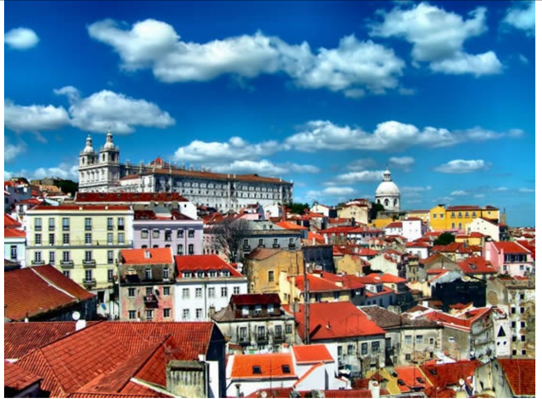
A brighter side of Lisbon.