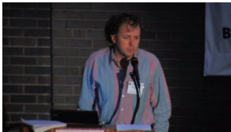
The man himself

If you find the individual cost prohibitive, consider a group purchase, if that's possible. Although a bit on the technical side, the presentations are still very useful for educational purposes in group meetings to discuss peak oil or relocalization. The Boston Conference featured an impressive cast