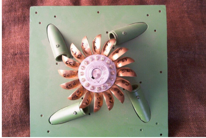
The Campo Nuevo Watermotor model 150.

The water motor is as easy to control and adjust as an electric motor. It has a power switch that allows instant on/off control, which makes it practical to directly power machines which must be turned on and off many times during use. The mechanism works by deflection of the water from the runner, so that the force of the flow does not increase the pressure in the penstock.