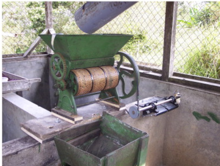
Direct Hydro Power Coffee Depulper.

This means that a small, modern hydropower plant has a similar efficiency rating to a centuries old configuration using a wooden vertical overshot water wheel (50-60%), and that this modern counterpart is considerably less efficient than the iron water wheels of the 18th century (65-85%). In an old fashioned hydropower installation, there was only one conversion of energy; A water wheel converted the energy inherent to the water source into rotational energy at its shaft. The same shaft also moved the machinery, so that the only source of significant energy loss occurred in the water wheel itself. [4]