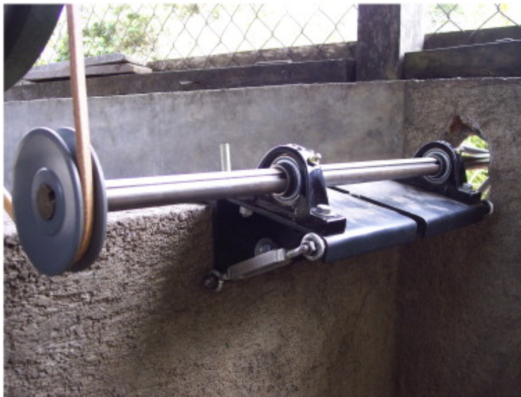
Picture: Direct Hydro Power Coffee Depulper.

Because of its higher efficiency a direct hydropower system is also cheaper than a hydroelectric power system. Less water is needed to produce a given amount of power, which means that all components of the installation are reduced in size, cost, and other resources. For instance, less civil engineering is required. Water can be carried to the turbine by low cost, low pressure, easily transportable, flexible, plastic tubes that are small in diameter as opposed to the rigid, large diameter penstocks common to electric hydropower plants. The flexible connections between the pressure pipe and turbine also simplify installation.