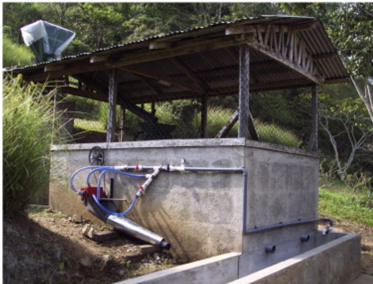
Direct Hydro Power Coffee Depulper.

In spite of these significant improvements, hydropower installations today are actually less efficient than those from earlier centuries. The culprit is electricity. Not long after the introduction of the water turbine, another change occurred: Instead of using water-powered prime movers to run machinery directly (as had been the case for centuries), water turbines were (and still are) used to generate electricity. This modern approach has introduced an energy deficit that has nullified any progress behind hydropower design efficiency.