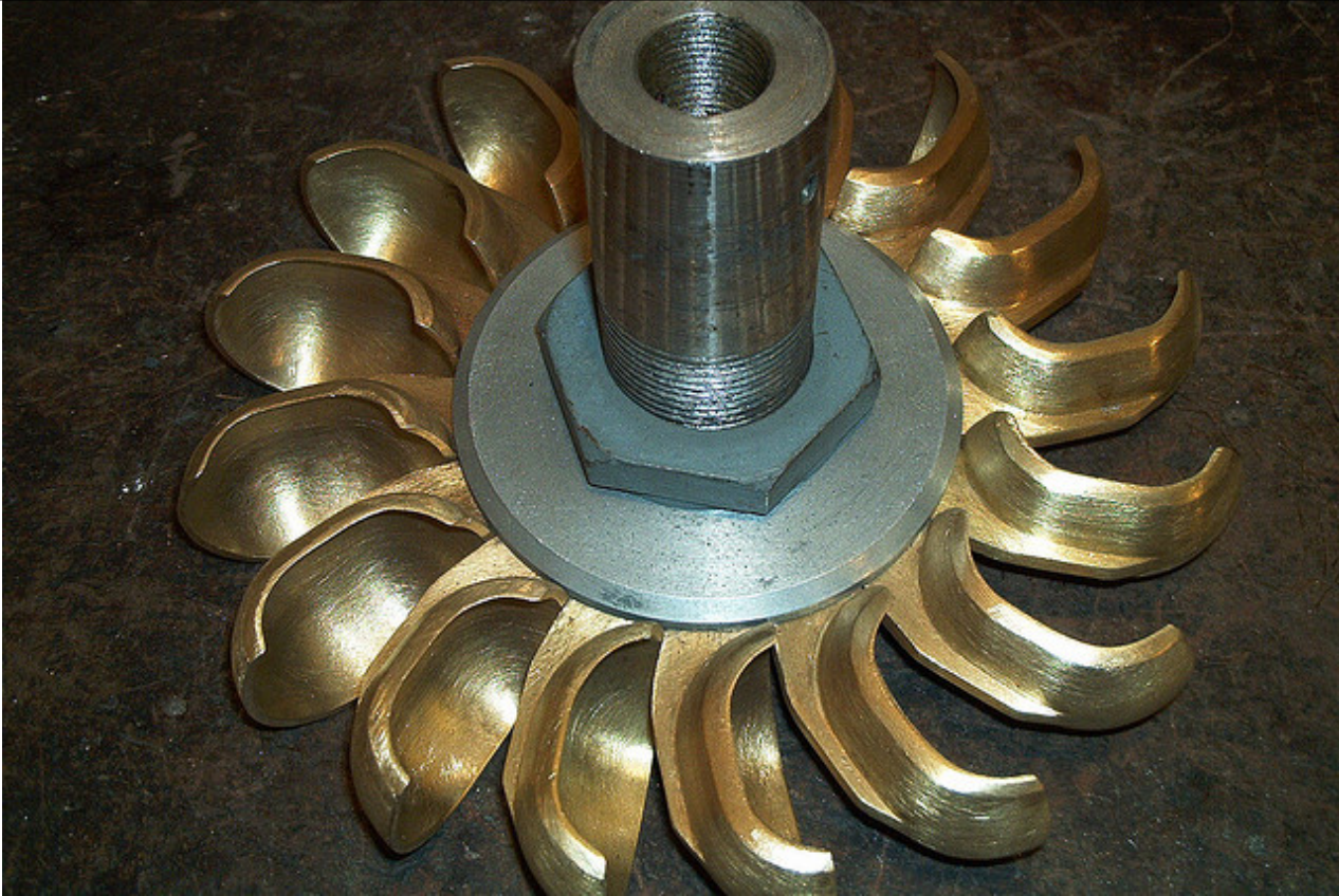
The bronze runner of the Watermotor model 150.

The installation can deliver a maximum of 800 watt mechanical power with a head of 35 m and a water flow of 300 liters per minute. The material costs amounted to just $1900. For comparison, Practical Action states that, when using appropriate technologies, a small scale hydroelectric installation costs $1,800 to $6,000 per installed kilowatt . It takes about two kilowatts of mechanical power to produce one kilowatt of electric power, so that direct hydropower is at least twice as economically viable as a hydroelectric operation with the same rate of energy production.